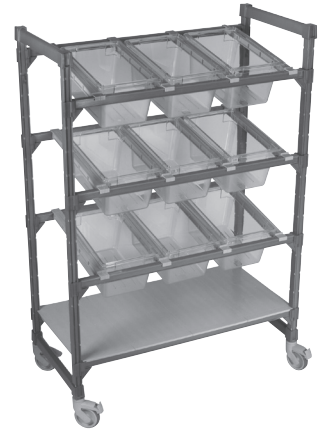
Mobile Flex Station Rack with Optional Full Size Food Pans and Optional Bottom Solid Shelf. (Sold separately).