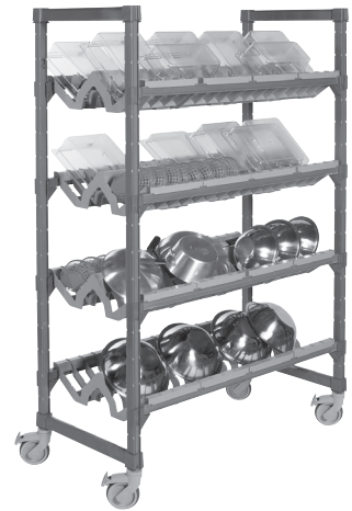
Angled Drying and Storage Rack