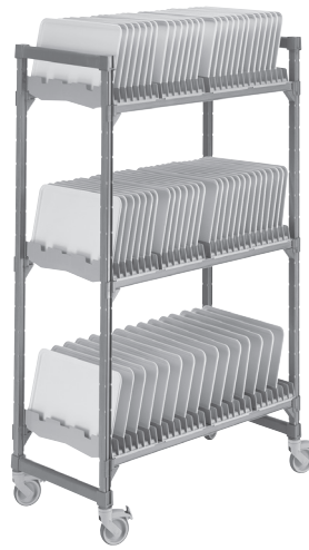
Vertical Drying and Storage Rack