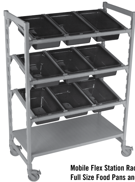
Mobile Flex Station Rack with Optional Full Size Food Pans and Optional Bottom Solid Shelf. (Sold separately).