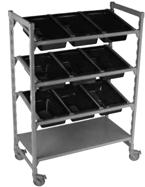
Mobile Flex Station Rack with Optional Full Size Food Pans and Optional Bottom Solid Shelf. (Sold separately).