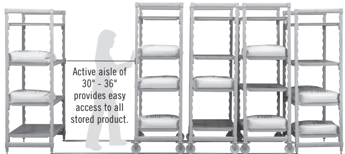
Stationary Unit High Density Mobile Units Stationary Unit High Density Storage Floor Track System