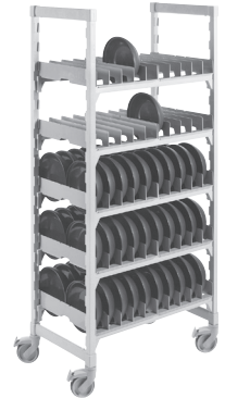
Dome Drying and Storage Rack