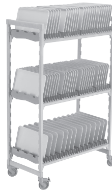
Vertical Drying and Storage Rack