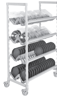
Angled Drying and Storage Rack